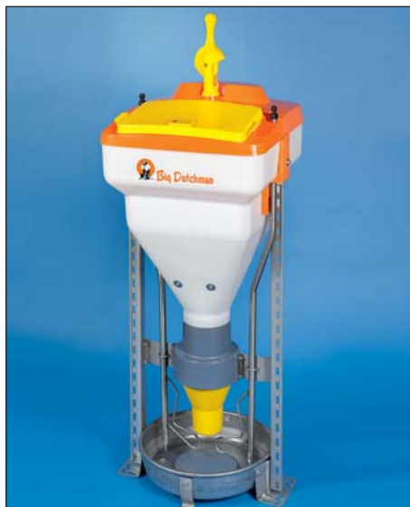
Swing for piglets