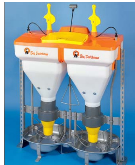
Swing-Jumbo for finishing pigs