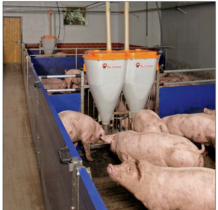
Group pen final finishing equipped with PigNic-Jumbo and divided door